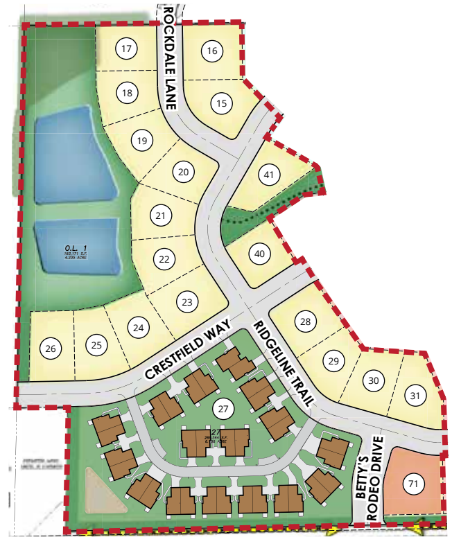
PHASE 1 - 20 LOTS

The Town of Greenville offers residents the ideal blend of rural community and urban connectivity. The Fox Highlands subdivision offers large home sites and is located just minutes from Appleton, the Appleton International Airport, and the Fox River Mall. Home sites in Fox Highlands feature connectivity to existing subdivisions, parks, and trails offering residents year-round recreational opportunities.